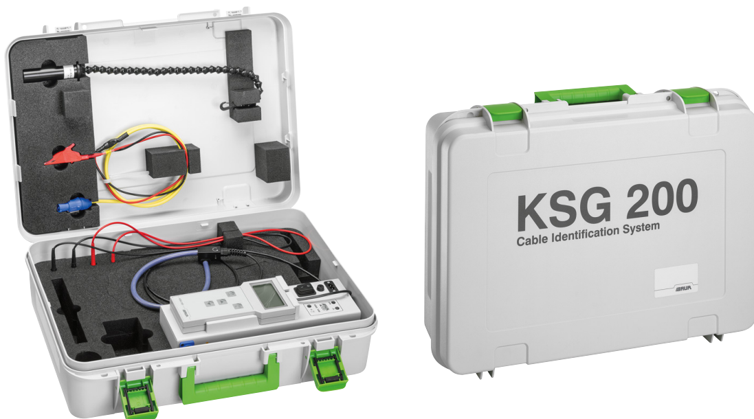
Figure: KSG 200 T (without battery)