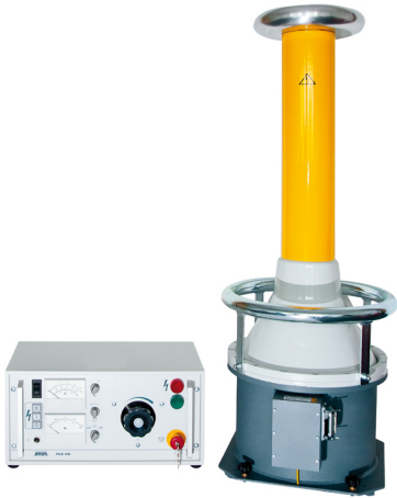
The figure is illustrative.