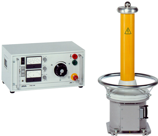
The figure is illustrative.